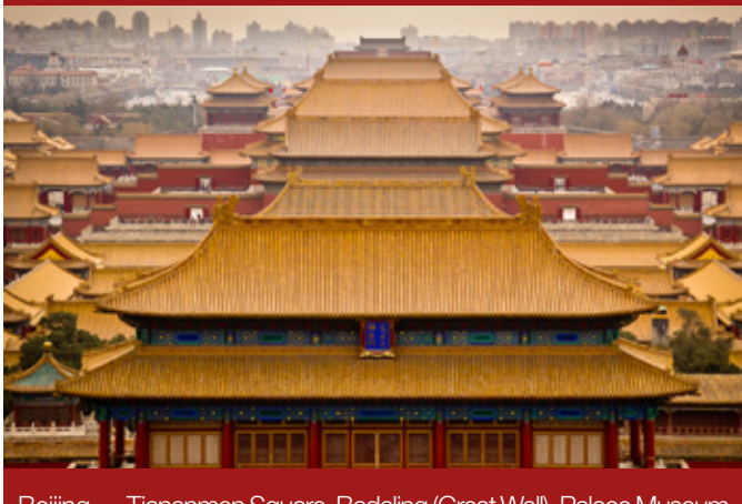
Beijing — Tiananmen Square, Badaling (Great Wall), Palace Museum, Prince Gong Mansion