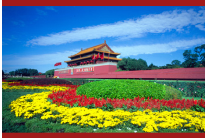
Beijing — Tiananmen Square, Forbidden City, Temple of Heaven, Badaling (Great Wall), Great Wall Museum of China, Summer Palace

Tianjin — Huangya Pass (Great Wall), Porcelain House Qinhuangdao — Laolongtou, Shanhaiguan