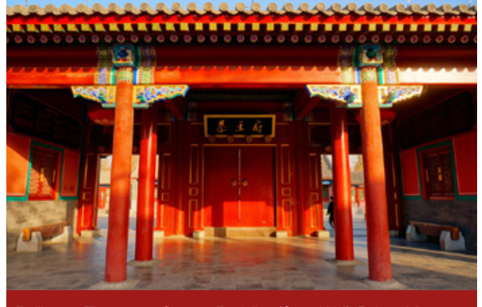
Beijing — Tiananmen Square, Badaling (Great Wall), Palace Museum, Prince Gong Mansion

Tianjin — Shi Family Grand Courtyard, Ancient Culture Street