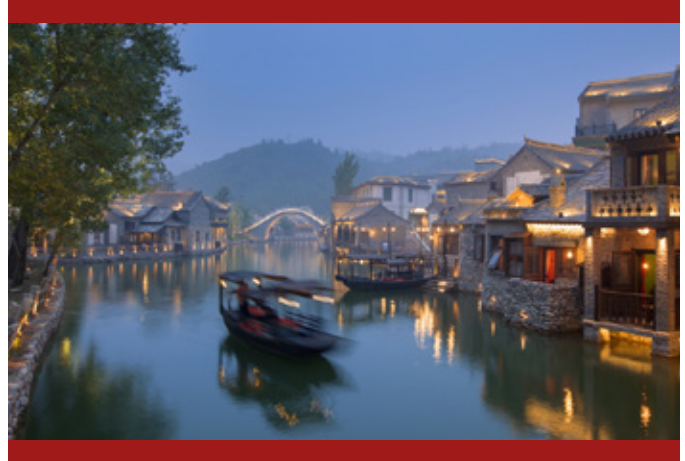
Beijing — Temple of Heaven, Tiananmen Square, Palace Museum

Miyun — Gubei Water Town, Simatai (Great Wall)